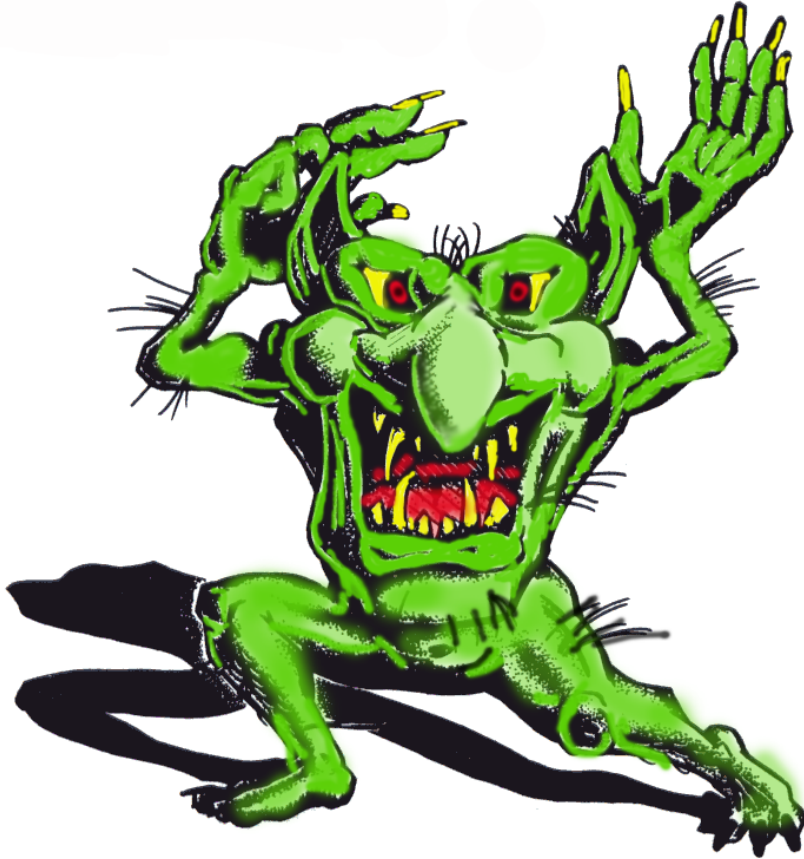
The Under Achiever Symbol